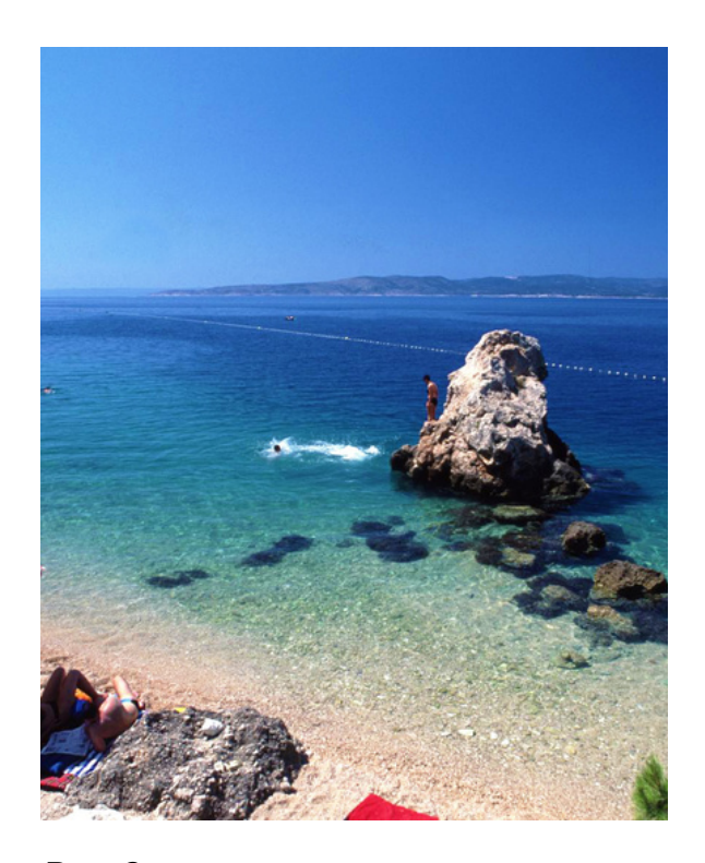
Day 2 KONAVLE BIKING

We start with a hearty homemade breakfast and then have a short drive to the village of Gruda. From here we get our bikes fitted and adjusted to our liking before setting off for a 35 km/21 mi bike ride along the Konavle Valley. The route veers past the Ljuta River and fertile farmlands of vineyards. We have a good climb to the small villages above the valley as we head towards Pridvorje. We make a stop along the way to a family home, where we have a tasting of local liquors and wine. Afterwards, we have a cooking class of local cuisine that we will feast on for today's lunch. Later, we return to Dubrovnik for some free time before dinner and overnight in the same comfortable B&B.