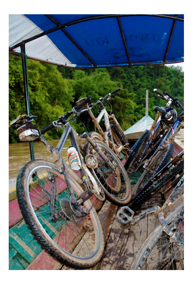
Day 2 BANGKOK TUK-TUK, TRAIN, & BOAT

This day is simply incredible! Today we'll tick off five must-see sites, while using all forms of urban transport (tuk-tuk, scooter, rapid train and boats) in a citywide blitz of temples, alleyways, rivers, canals and fine eats to give you a true appreciation of the 'City of Angels'. Today you'll see the Golden Mount, the stunning Grand Palace, Wat Po (reclining Buddha), Wat Arun and the urban-canals of Bangkok Noi, to name but a few of our stops. Not only can you tick Bangkok off your list, but also you'll do it in swinging style!