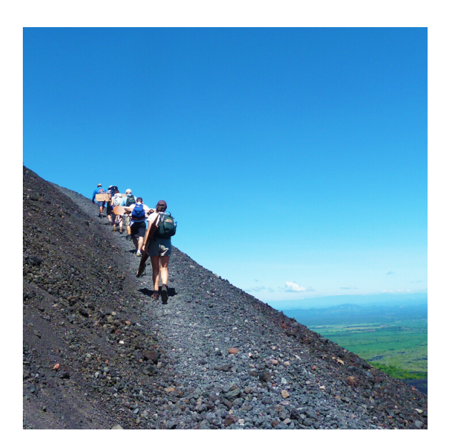
Day 3 LEÓN - CERRO NEGRO VOLCANO HIKING & SANDBOARDING

In 1992, Cerro Negro Volcano buried León in ash and sand reminding the city of the uncertainty of living near volcanoes. Its most recent eruption came in 1998. Following breakfast, we drive to the base of the volcano and begin the climb up to the top of Cerro Negro Volcano. There will be a chance to look into the mouth of this active volcano and enjoy the spectacular views before beginning a much quicker and exciting decent. Sitting or standing on sand boards are the quickest way down, but just walking down the sand slopes is also exhilarating. From here we return to León for lunch. The plan for the afternoon is a short drive to the Pacific coast for an afternoon on the beach. Total duration of climbing and sand boarding 4 hours.