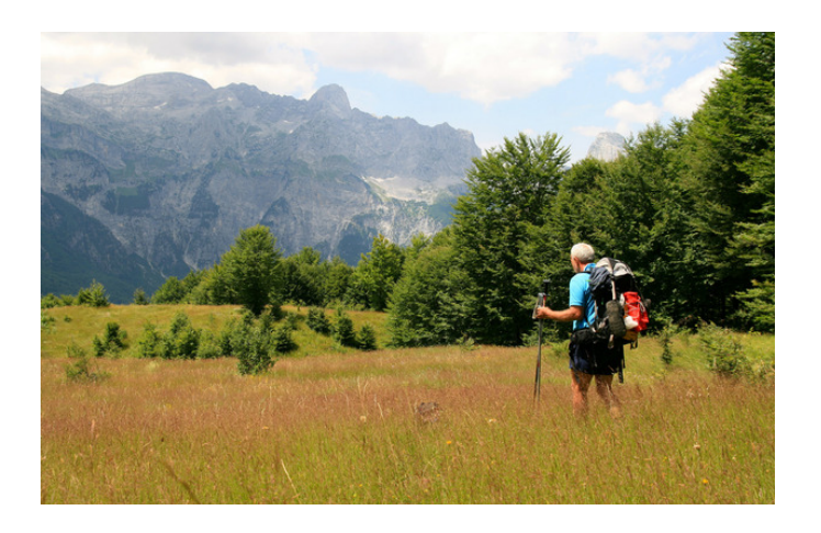
Day 2 ALBANIA - KRUJA - LEPUSHE TREKKING

We'll start our Albanian adventure with a hearty breakfast and then transfer by vehicle 1.5 hours to the town of Shkodra. After some time to explore the town, we get back into our van and drive another 1.5 hours to Kelmend, the 'rooftop of Albania' via the scenic pass of 'Leget e Hotit.' We'll pick up our picnic lunch in Tamara and then it's just a short distance to the trailhead, where we'll begin our first hike, which is mostly an ascent, to a cascading waterfall. We'll stop for a picnic somewhere along the river before descending back into the valley. At the bottom, we'll meet our vehicle and have a short transfer to the village of Lepushe. There, we will check into a basic local guesthouse, owned by an Albanian family, and they'll prepare us a dinner of traditional dishes.