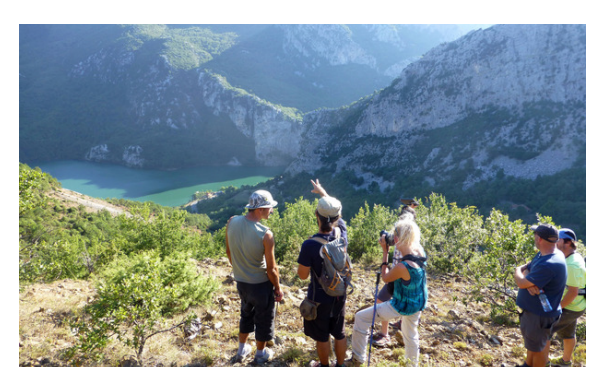
Day 3 ALBANIA - LEPUSHE - MONTENEGRO -LAKE PLAVE