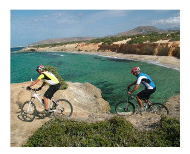
Day 3 ATHENS - NAXOS BIKING

We'll wake with the sunrise and transfer to the port in Athens where we'll catch a ferry to the Greek Isle of Naxos. The journey is about 4-5 hours, traveling at high speed on the Aegean Sea. Upon arrival we'll transfer to a comfortable hotel and have some time to settle in. Then, we will start our cycling fun. We start with a nearly flat part on good surfaced roads before making our first climb. Passing by some ruins of the ancient aqueduct of Naxos, we will soon roll down to the fertile valley of Engares. In the small village, we will have a view of the beautiful church next to the olive museum. If we wish, we can cycle down to the bay of Amiti and its sandy beach. On our way back, we will stay close to the coastline and get a perfect view on to Portara and the entire capital of Naxos island. We'll return to our hotel in the early evening and enjoy a Greek feast in a traditional tavern.